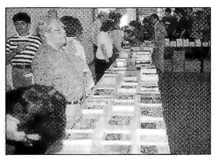
The Reformation in Brazil runs on the wheels of literature. The tables at the FIEL Conference were loaded with excellent books

We found that Reformed doctrine is now beginning to make a significant impact in Brazil. The past few years have seen great growth in the sales of Reformed literature. These are exciting days, compared by some to the beginnings of the Banner of Truth in the UK in the 1950s. There are signs that the Lord's people in Brazil have a hunger for more substantial Bible teaching and are being attracted to the Reformed faith.