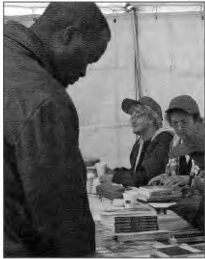
The bookshop in the tent at Barberton

Standing in the conference grounds of Emjindini, in Barberton, I noted that for 360 degrees mountains fill the horizons. Barberton is warmer than Pretoria in winter and certainly mid-winter in Barberton is warmer than UK's summer. Prevailing sunshine and the altitude provide an