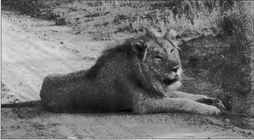
Another example of intelligent design

his continued denial of a purpose and therefore a Creator bears the hallmarks of suppressing the clear truth about creation (Rom 1:18-19).