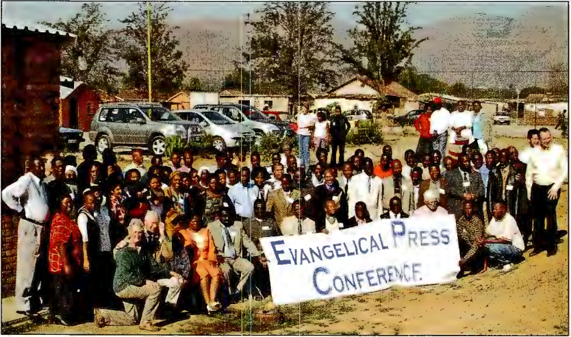
Group photo of conferees at Barberton, see report page 27