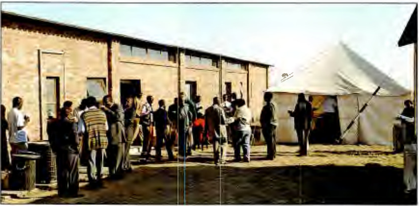
View of tent at Barberton which was used for the bookshop during the conference