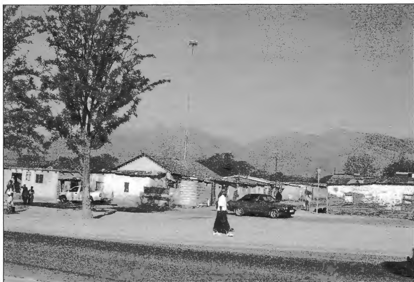
View of mountains from conference centre, see report page 27

and fail to take account of its inextricable links to physical descent and the concept of a nation.